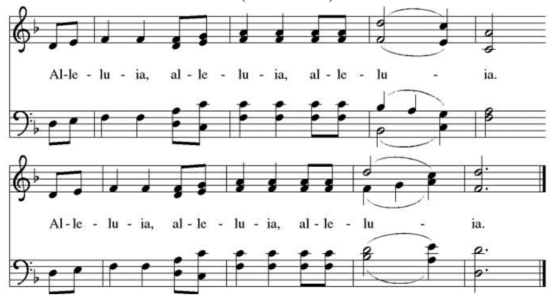
Text & music © 1998 Les Presses de Taizé, admin. GIA Publications, Inc. All rights reserved. Music: "Allelujah 7" by Jacques Berthier.

Reprinted and streamed with permission under ONE LICENSE, License #735766-A. All rights reserved.